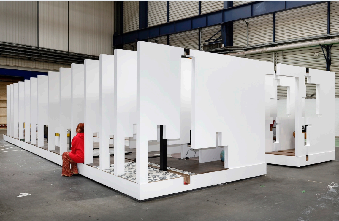
Pedro Gómez-Egaña, Virgo , 2022. Installation view: Biennale de Lyon, 2022.

February 21 – July 27, 2025, Hayden & Reference Galleries