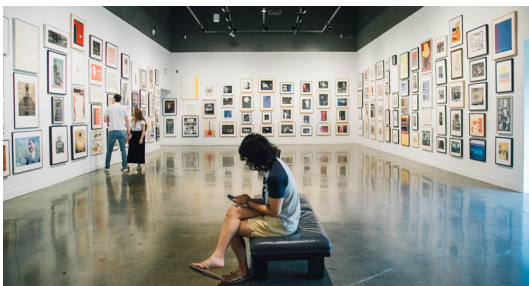
2018 Student Lending Art Program Exhibition September 4 - 16, 2018