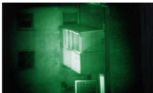
EXHIBITIONS AROUND CAMPUS Intuition and Vision August 16, 2017 - July 1, 2019