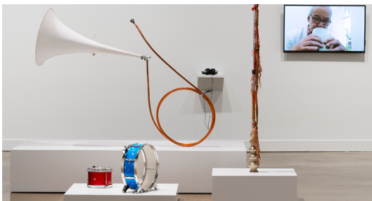
Introducing Tony Conrad: A Retrospective October 18, 2018 - January 6, 2019