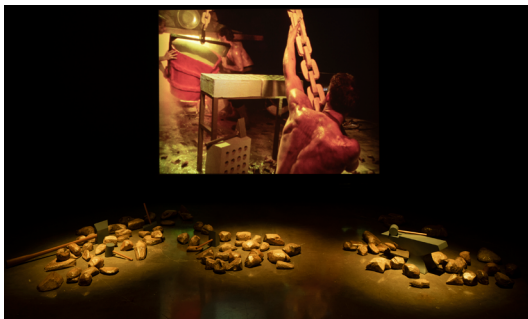
Ericka Beckman: Double Reverse May 24 - July 28, 2019