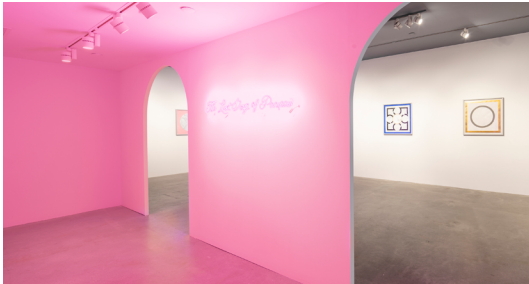
List Projects: Delia Gonzalez July 31 - September 30, 2018

DURING FISCAL YEAR 2019 (JULY 1, 2018–JUNE 30, 2019) THE LIST CENTER PRESENTED EIGHT EXHIBITIONS: