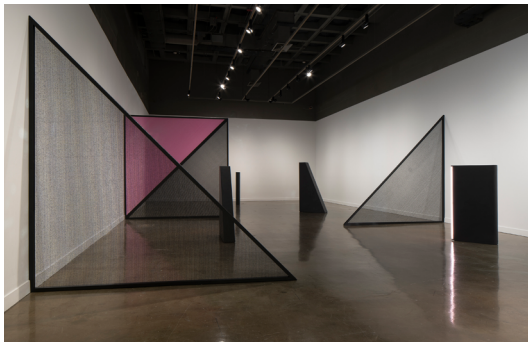
Kapwani Kiwanga: Safe Passage February 8 - April 21, 2019