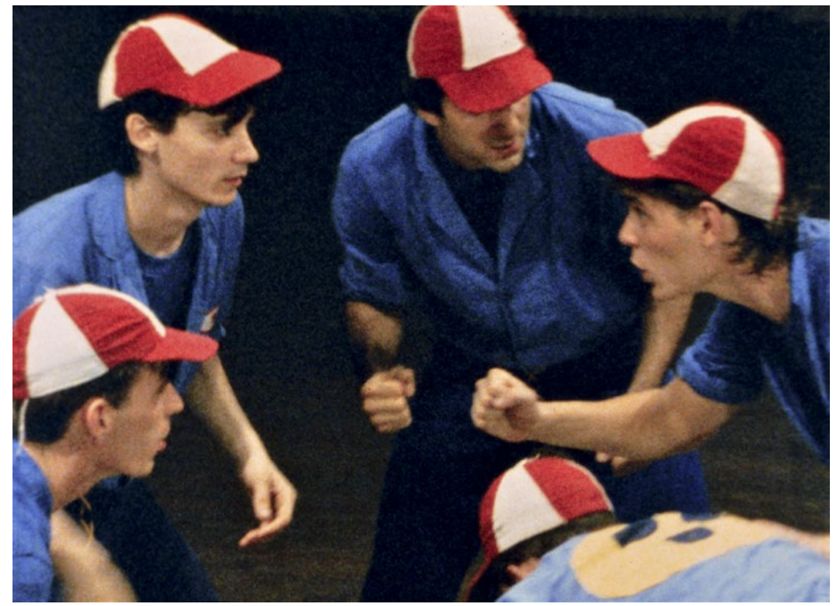
Still from You the Better